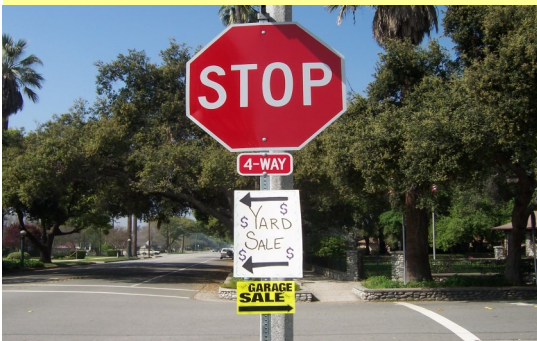
Illegal signs attached to a City street post.

The City of Glendora does not require residents to obtain a permit. Yard sales may only be conducted within a residential zone. Commercial lots whether vacant or developed are not permitted areas for conducting yard sales.